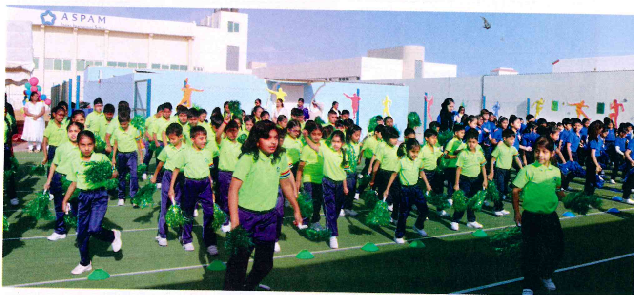
STEPPING FORWARD: The school community came together for the many activities that took place at the annual sports event